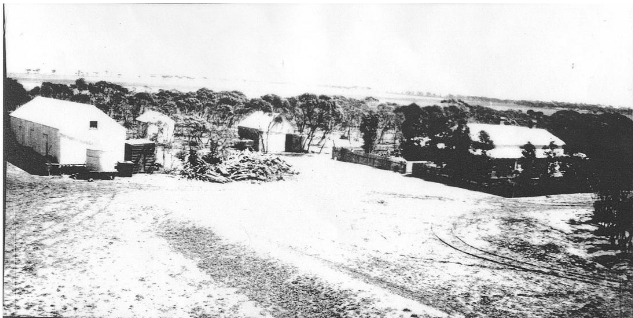
From the windmill, showing barn, hut, garage, and house, c1927