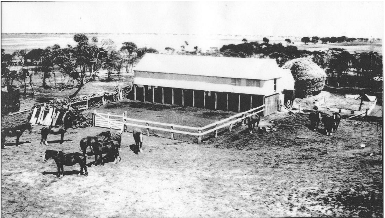
The stable and a haystack, c1927

He also had the large stable built, one of the best in the district. The chaff that was cut from the adjoining haystacks was elevated into the loft above and fed into the feeding troughs below. There were up to 32 horses on the farm plus a stallion "Top Score" so there were nearly always two teams working (The Mallee roots on the south side of the stable yard were gathered and carted using a horse and tipping dray.) In the yard there were two large hollowed out logs which served as extra feeders.